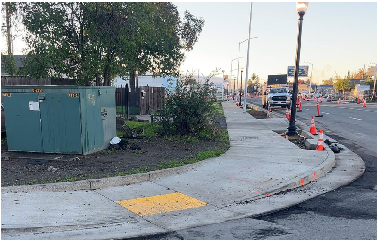
Figure 4 Franklin Boulevard Complete Streets includes $4,000,000 of accessibility improvements. This image shows the amount of sidewalk concrete improvements being placed along the corridor.

The purpose of the Auburn Boulevard Bridge replacement project was to provide a new structure that is consistent with current design standards for roadway geometry, accessibility, and structural integrity, to increase hydraulic capacity, and update the Auburn Boulevard and Winding Way intersection to enhance pedestrian safety and improve the existing intersections operations. This project was a partnership with the County and included installation of new accessible curb ramps, signals with APS, and sidewalk and roadway slopes that meet accessibility standards.