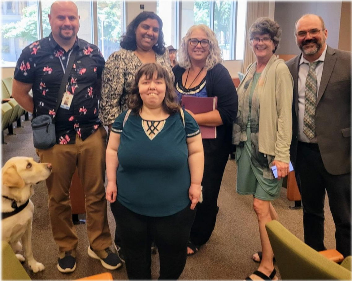
Picture taken after the approval of the 2024 DAC Annual Report