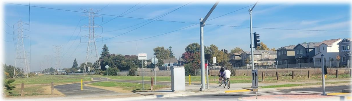
Figure 2 Picture of completed trail improvements Ninos Parkway was reviewed by the DAC January 2024