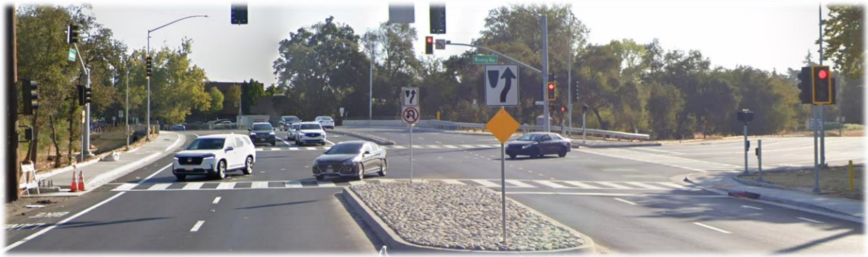
Figure 3 Picture of Auburn Boulevard at Winding Way bridge replacement with accessibility improvements at intersection.

The purpose of the Auburn Boulevard Bridge replacement project was to provide a new structure that is consistent with current design standards for roadway geometry, accessibility, and structural integrity, to increase hydraulic capacity, and update the Auburn Boulevard and Winding Way intersection to enhance pedestrian safety and improve the existing intersections operations. This project was a partnership with the County and included installation of new accessible curb ramps, signals with APS, and sidewalk and roadway slopes that meet accessibility standards.