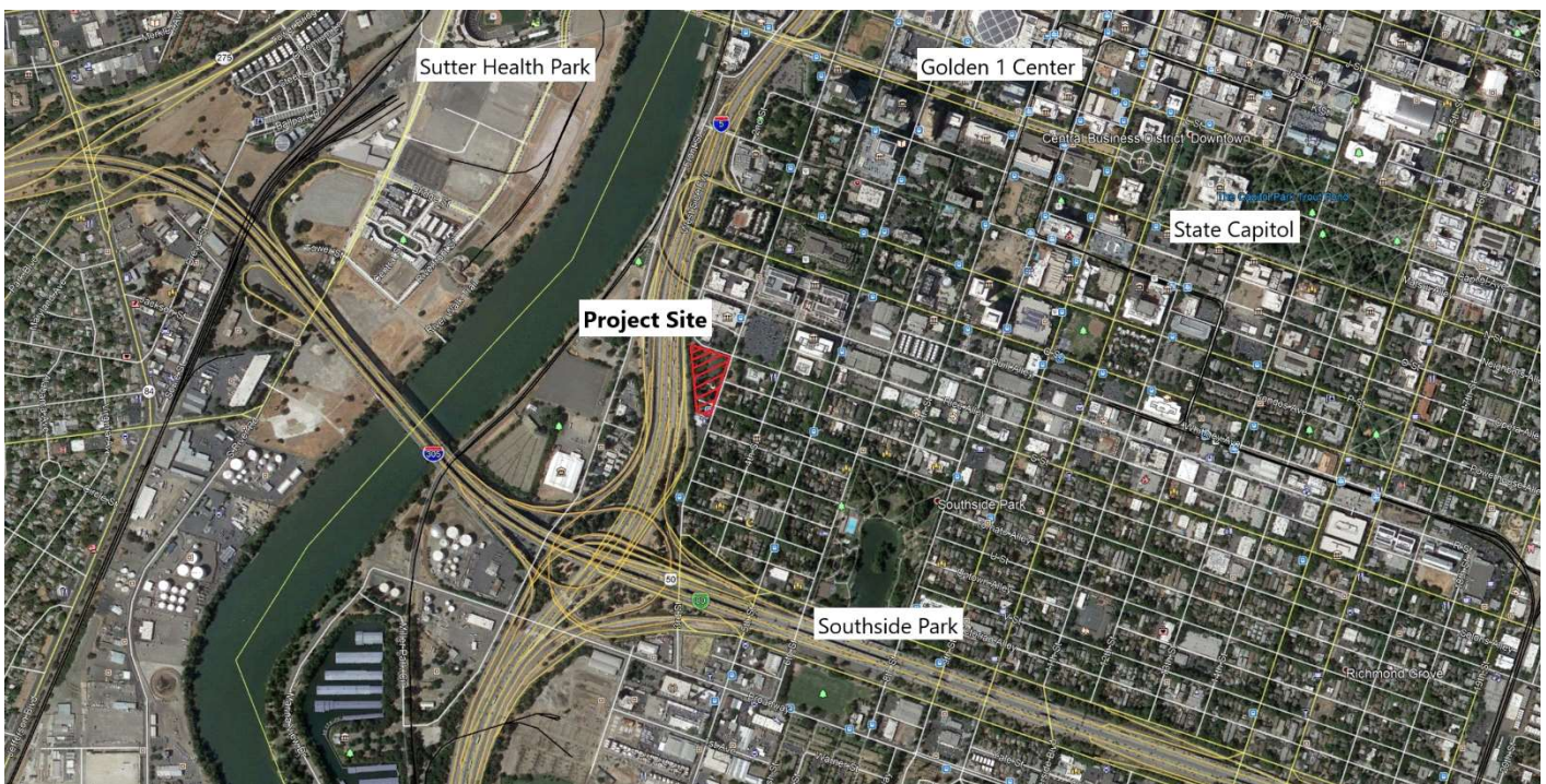
Figure 2: Contextual Aerial