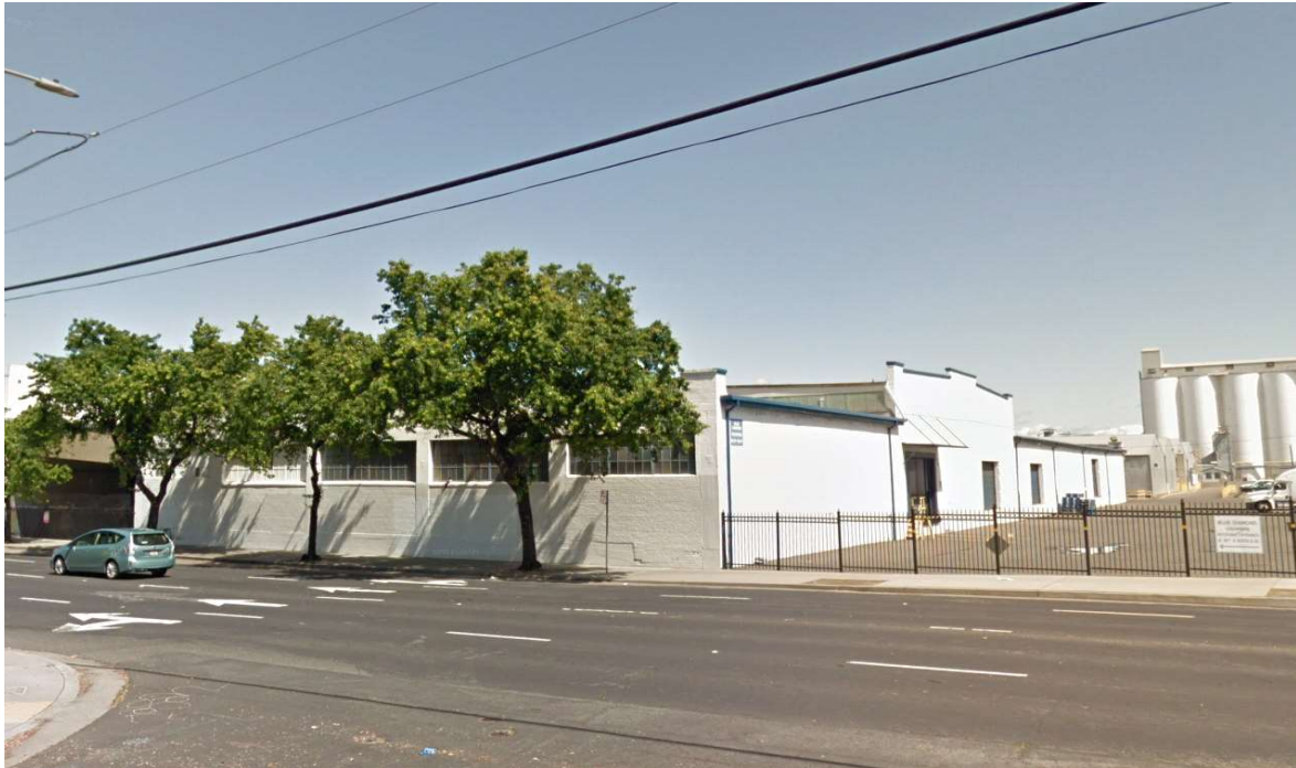
Figure 2: Project Location