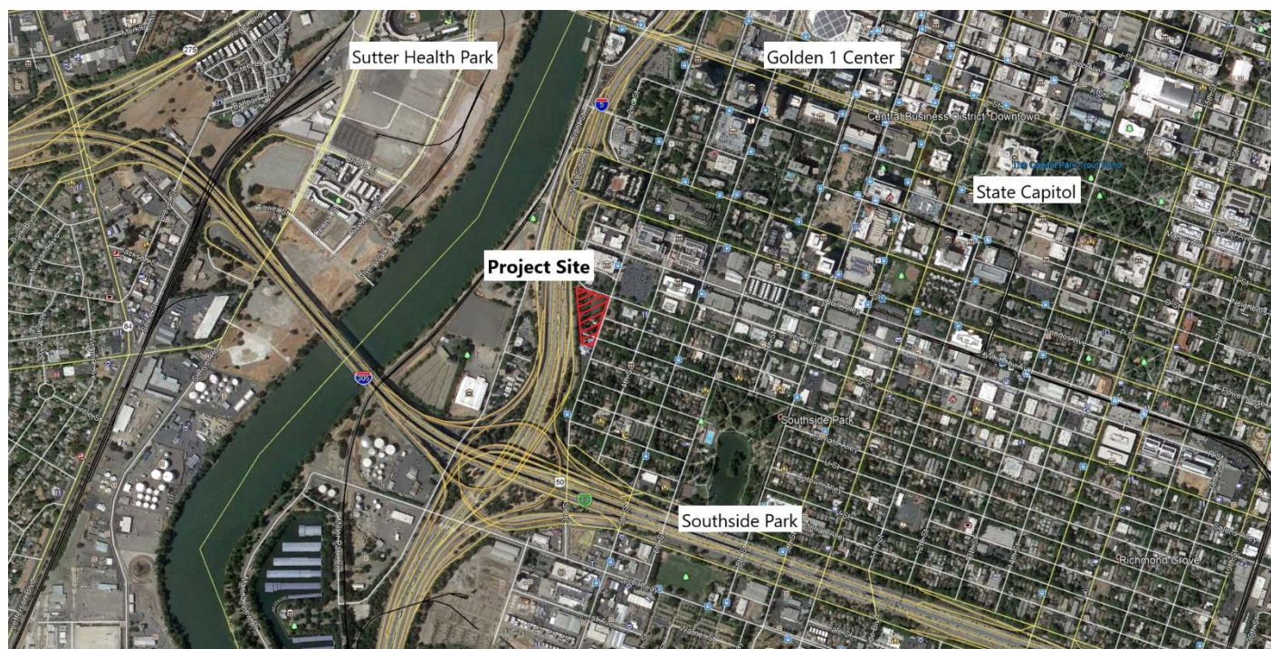
Figure 2: Contextual Aerial